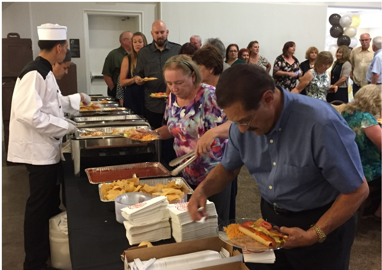
Employees line up for the buffet dinner.