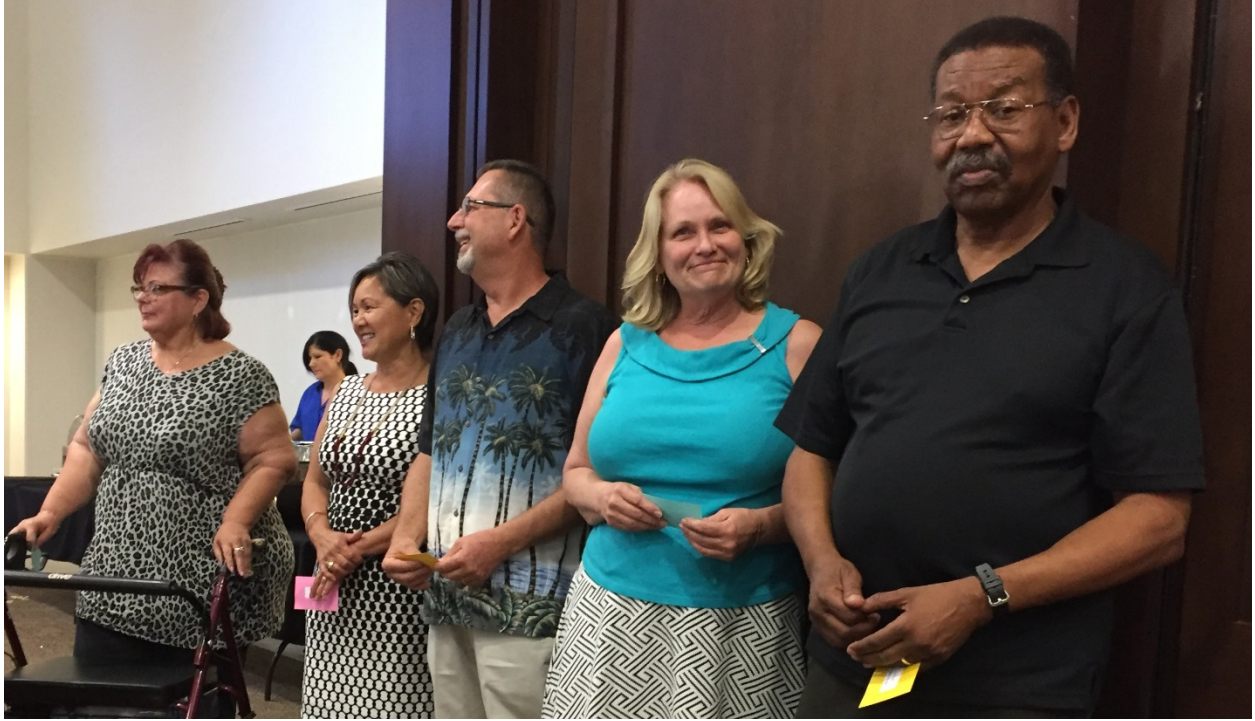
These Chino Valley Unified School District employees have served the District 35 years or more.